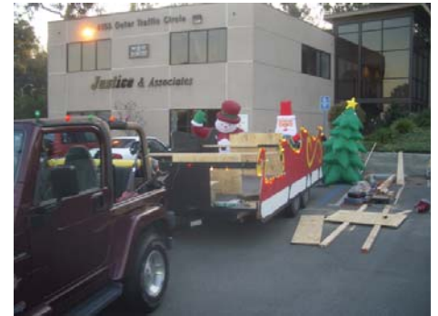
The making of the Christmas Parade Float - 2004.

Most of us can remember our Christmas float for the Seal Beach parade in 2004. You know the Santa's sleigh. He had that rigged just right. He was so proud to pull that float down Main Street with our decorated Jeep and all the employees participating.