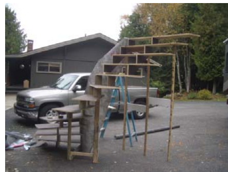
Mike - practice building our staircase for the house...leaving nothing to chance.

home he would be at his computer drawing some more. I remember he would walk into the Long Beach building during construction and immediately recognize that they had built a wall 1/4" from what the plans prescribed. When they used 3/8" drywall instead of 1/4" drywall, he ran around measuring to see if the desks would still fit perfectly. How did he do it?